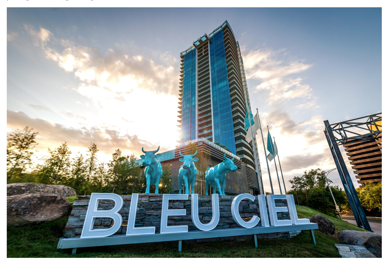
Welcome to Bleu Ciel, a true designer home in the sky, right where everyone wants to be in Dallas.

Bleu Ciel cares for your vehicles as much as they care for you. Each residence has its own private, enclosed garage within the larger garage. Don't have time to park yourself? Drop off your car at the valet in front of the building and they will take your car to your garage for you. Valet will also park your guests. No parking downtown? You can't relate.