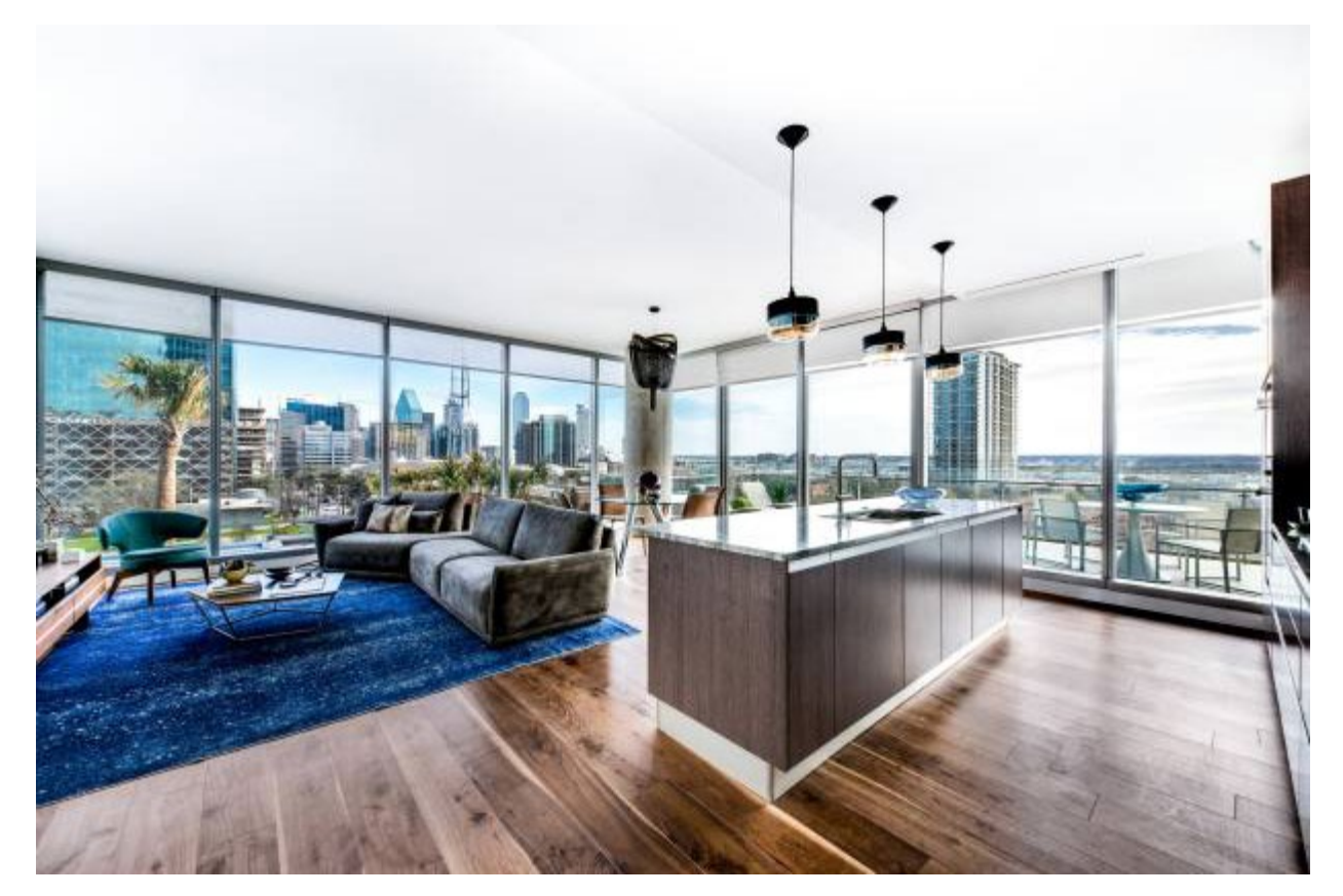
The 33-storey condominium was designed by French architect Jean-Michel Wilmotte and Dallas-based HDF

At home, residents feel like they are living at a resort. The hotel-like amenities of the glitzy tower include the largest terraces in Dallas, private spa, yoga room, exquisite gym, residents-only wine storage and tasting rooms, 24/7 concierge services to assist with restaurant reservations and travel arrangements, and other luxury amenities.