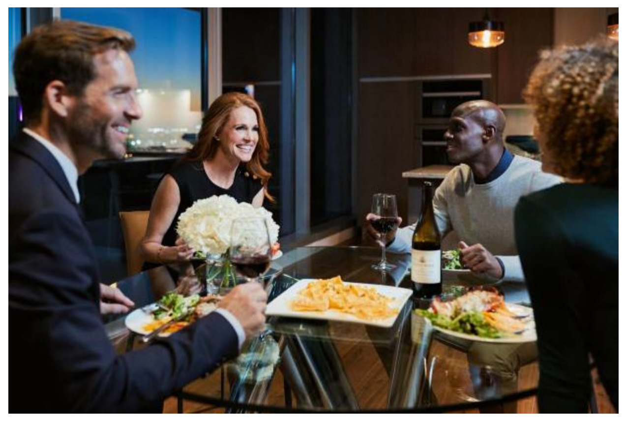
Bleu Ciel is bringing the luxuries of vacationing into residents' everyday lives

luxury living and has built a 19-city-block community known as the Harwood District, featuring unparalleled amenities, noteworthy museums, gardens and restaurants. One concept within walking distance of Bleu Ciel is Dolce Riviera, the city's most notable Italian restaurant and Harwood Hospitality Group's seventh concept within its culinary collection of restaurants and eateries.