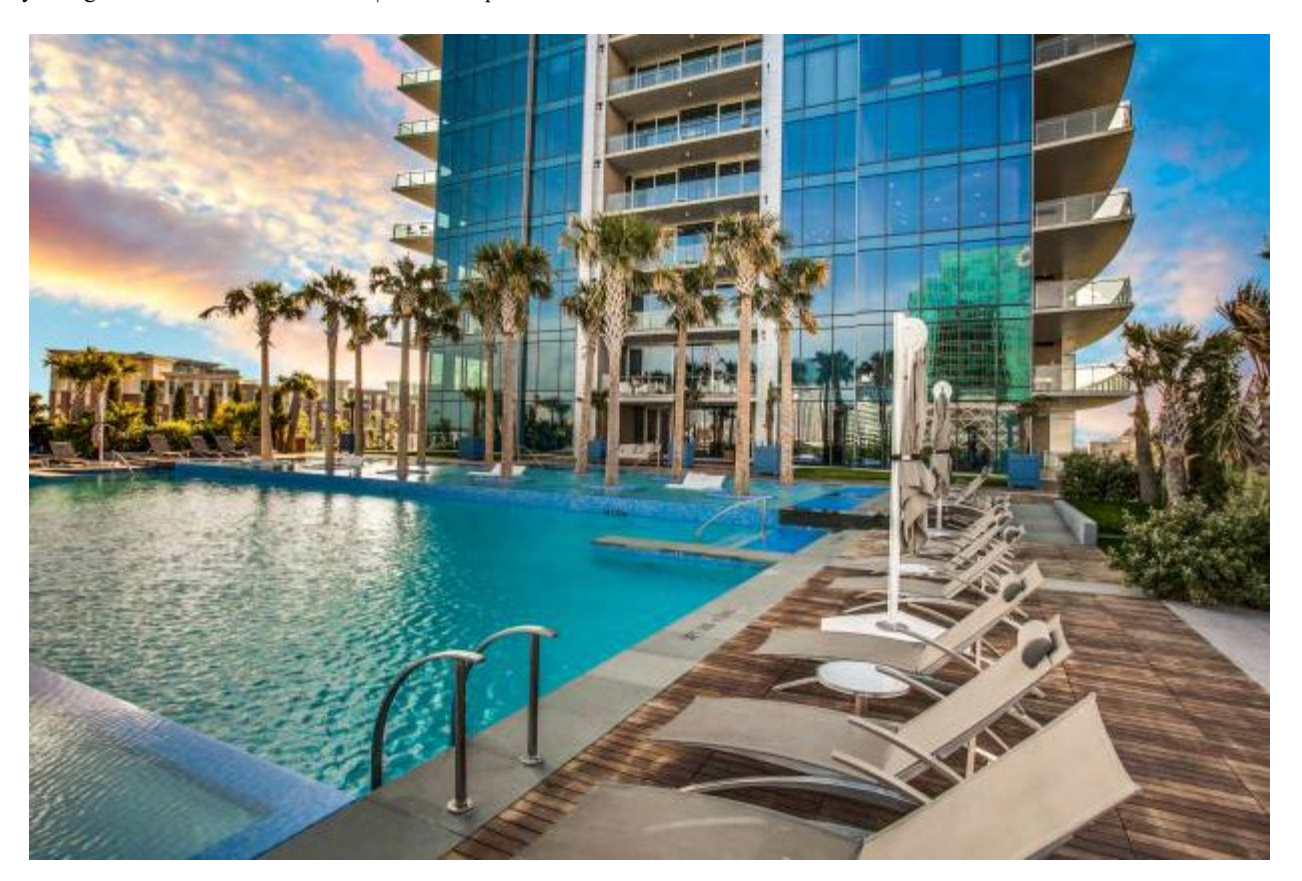
Bleu Ciel features hotel-like amenities