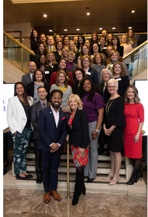
School counselors' tireless efforts never goes unnoticed.

We would like to thank our dedicated partners for joining us in person and in spirit. Our work to support students' dreams of higher education would not be possible without them. Special recognition goes to all of those—especially the school counselors themselves—who help to make higher education a reality for our nation's students. Your tireless efforts never goes unnoticed.