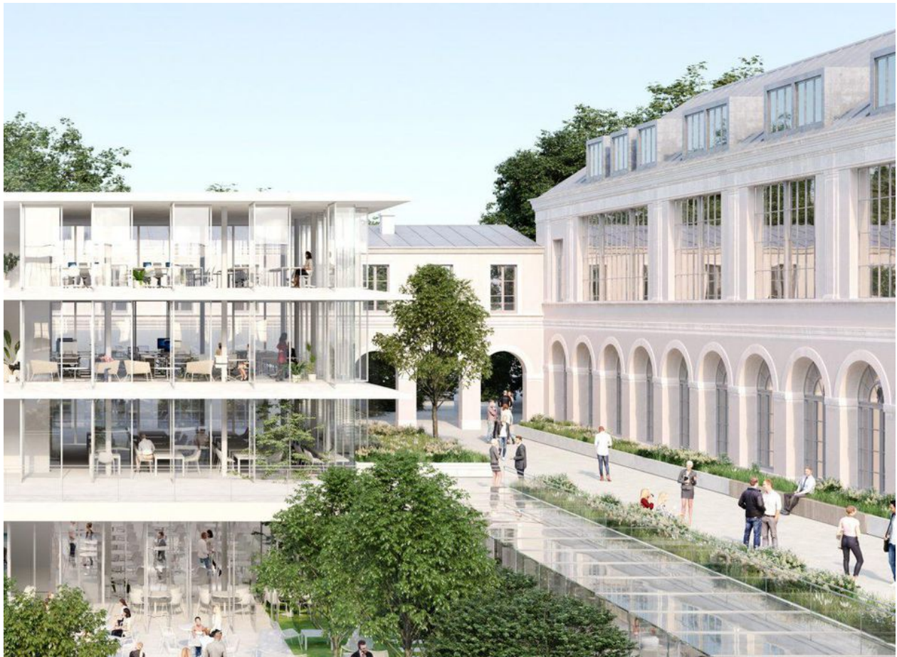
Sciences Po Campus in Paris

I am really honored to be part of this French official institution. The Academy gathers all the Arts: music, painting, sculpture, engraving, cinema, choreography, photography and architecture. It is so great to be able to meet at the same time a colleague who is an architect, a musician or a great photographer. Together, we reflect and discuss on really interesting topics. It is incredible to have so many creative people in one place.