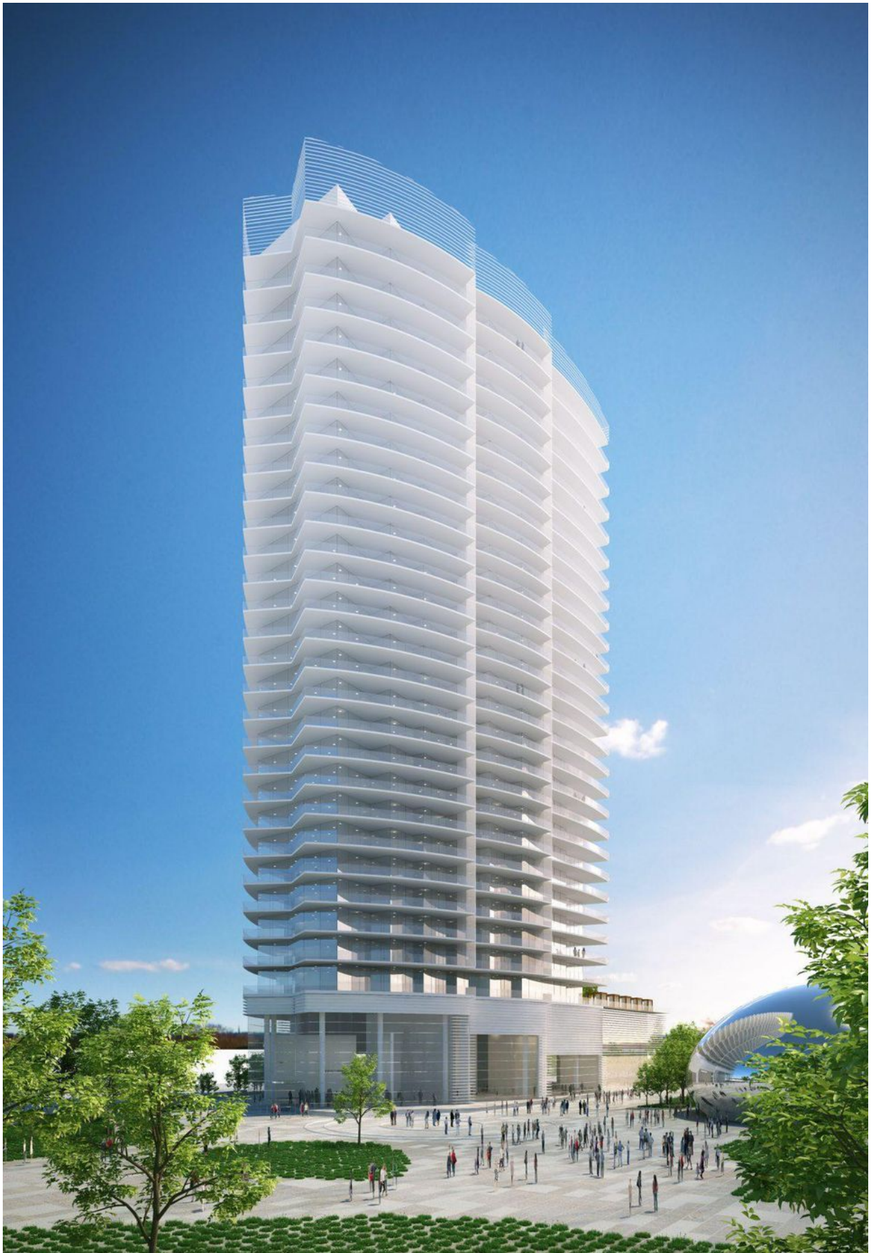
Bleu Ciel Tower in Dallas WILMOTTE & ASSOCIÉS