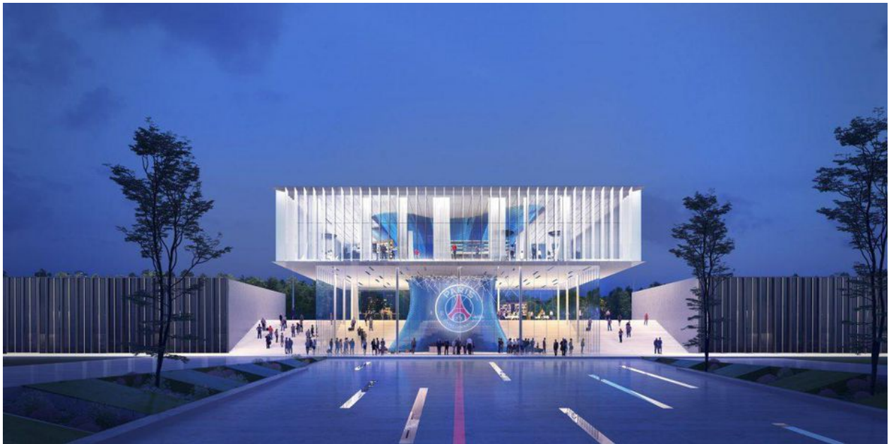
Future sport center of French Soccer Team PSG WILMOTTE & ASSOCIÉS

The selection was so hard. In fact, I took the end part of my agenda with the alphabetical order and during one year I wrote almost a word per day. I got 350 entries and they published 200. This project was very long but very interesting, it took me four years to do it! I discovered outstanding places and it is too bad that there are not in the book! But I'm really proud of having done this Dictionnaire Amoureux .